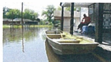
Rethinking Flood Control