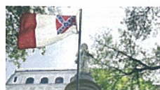
Murder Appeal Raises Confederate Flag Issue