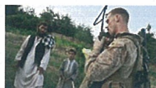
Max Boot: Bin Laden's Death Changes Little