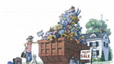
Forget Martha Stewart—Try Mother Hubbard