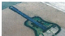
A Tribute to Wife in Trees